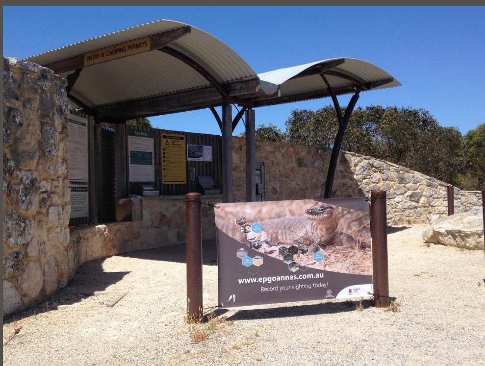
Entrance to Lincoln National Park