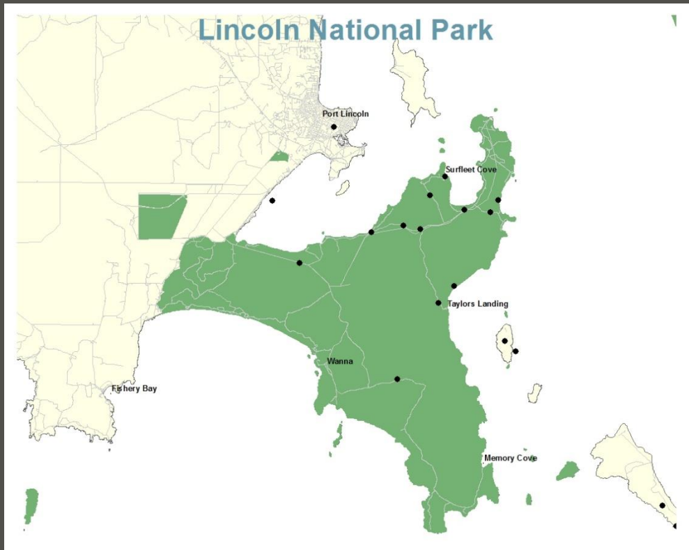
Sightings before EP Goannas