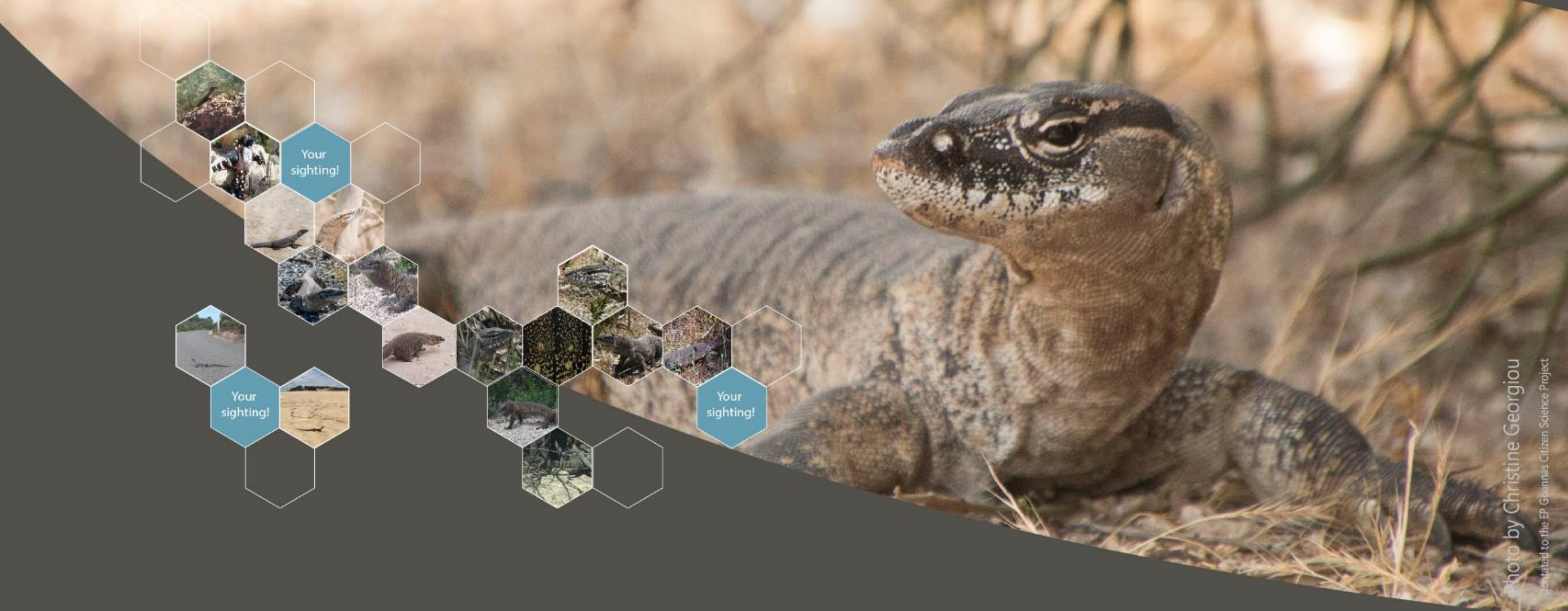
Contributed to the EP Goannas Citizen Science Project