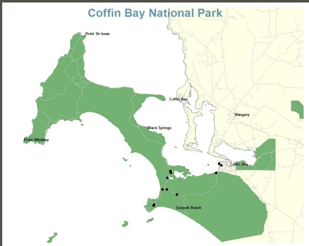
Sightings before EP Goannas