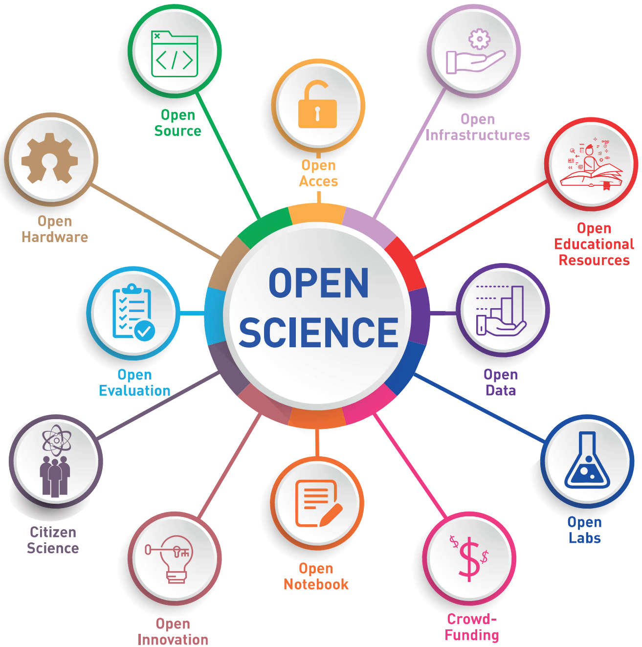
Components of Open Science