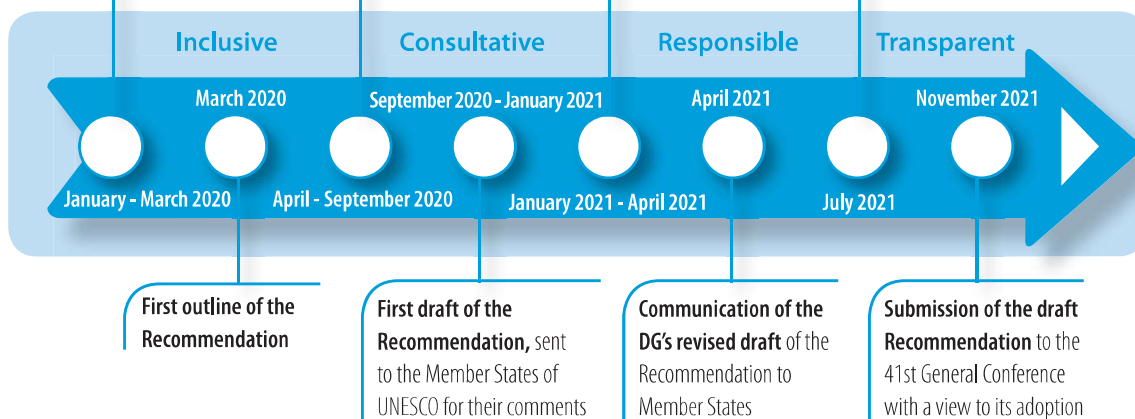
Roadmap to the UNESCO Recommendation on Open Science

Meeting of the special committee consisting of technical and legal experts appointed by Member States (category II meeting)