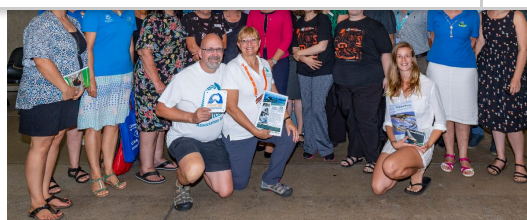
ACSA-QLD committee members together with Hon. Leeanne Enoch, Minister for Environment and the Great Barrier Reef, Minister for Science and Minister for the Arts