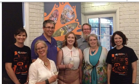
ACSA-SA committee members and guest speakers