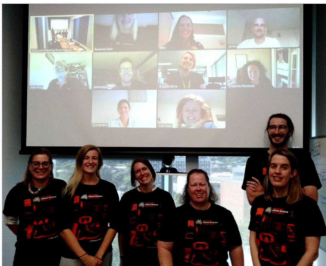
ACSA's Management Committee meeting 2020-style.