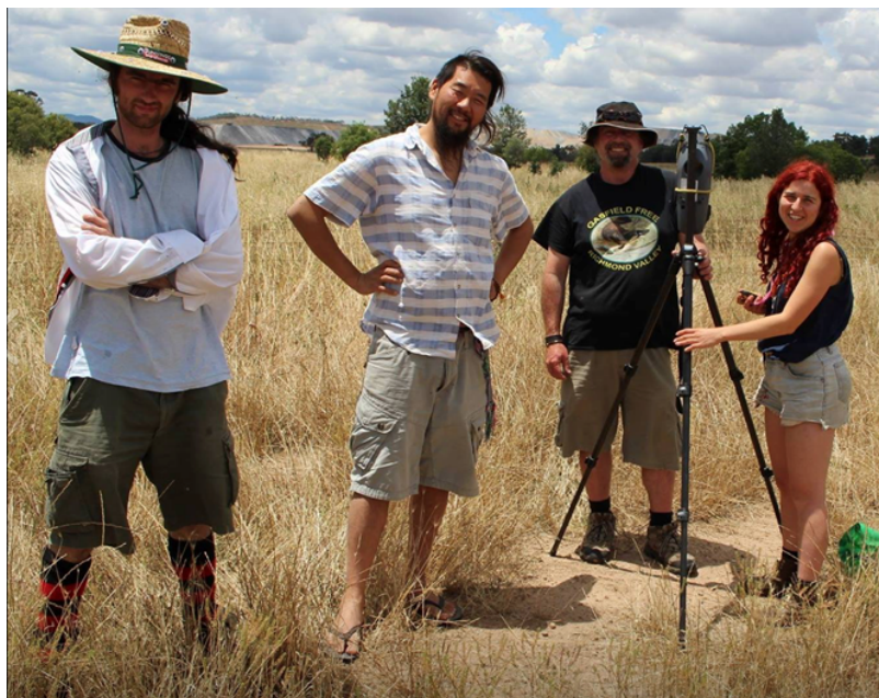
Members of Leard Forest Research Node conducting ambient air monitoring and dust deposition monitoring at a farm adjacent to Maules Creek Coal Mine

ACSA is in the process of building a library of citizen science photos that we can feature on our website and use in general promotion of ACSA and citizen science. And we'd love to hear from YOU!