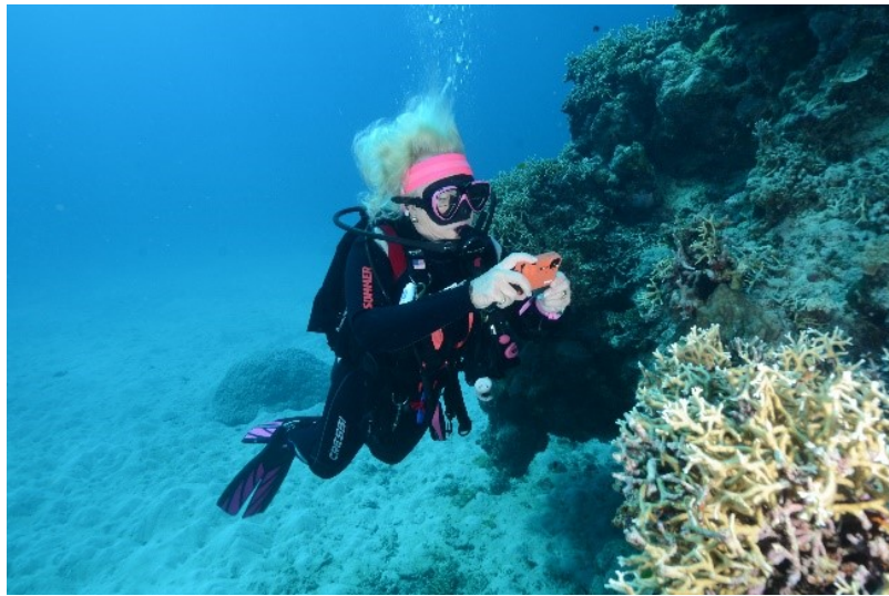
Image of Virtual Reef Diver (Queensland University of Technology), finalist in the 2019 Eureka Prize for Innovation in Citizen Science.