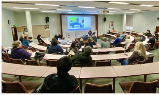
Participants in the Big Bushfire BioBlitz ACSA-WA's Pathways to Citizen Science forum