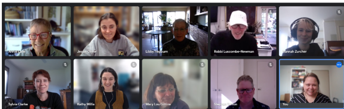
ACSA Management Committee members and staff at the 2023 Strategic Planning session